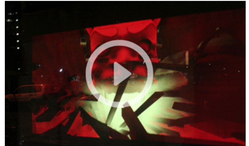
(L) Dante From the series 'Miracle Strip', 2015-16 Photographic prints and projection works 180 x 110 cm