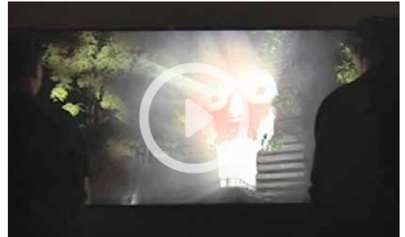
(L) The Coachman From the series 'Dreamweavers,' 2013-15 Photographic print and Lightbox works 200 x 140cm