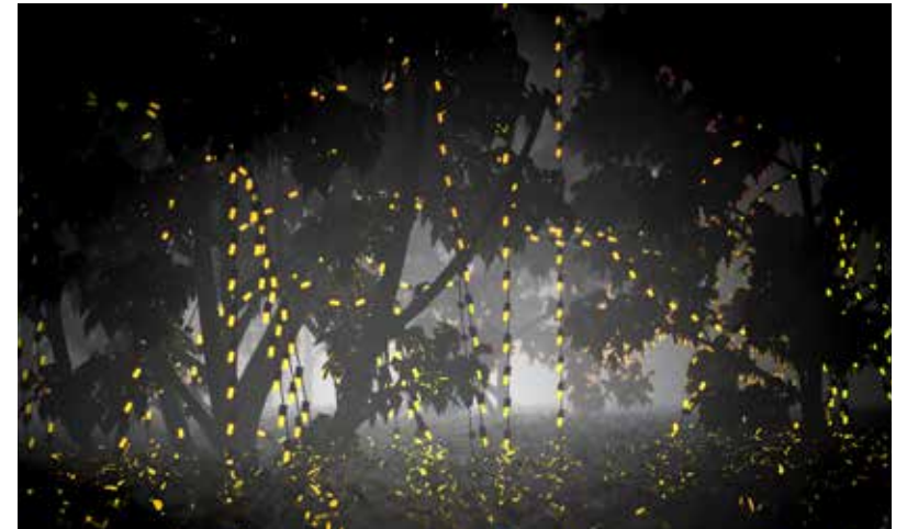
(L) Recovery From the series 'Debris', 2018 Photographic prints 120 x 80 cm