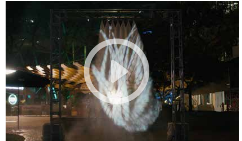
Collision Temporal projections on water, 2021 Federation Square, Melbourne 4 x 4m